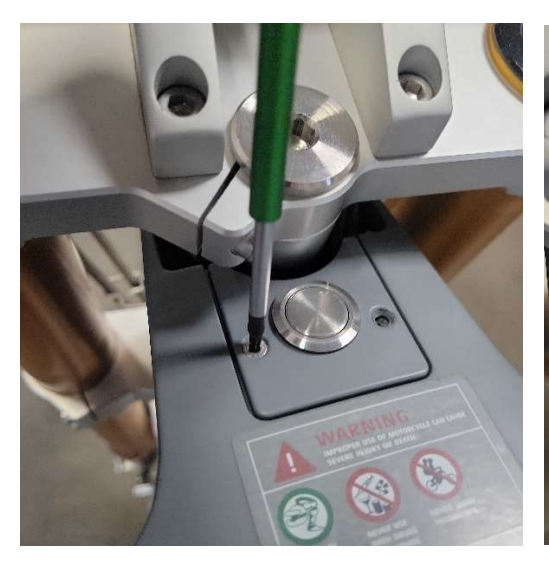
Step 1: Using a Torx T10, remove the 2 securing screws for the front bodywork lid. You do not need to disconnect the silver power button.