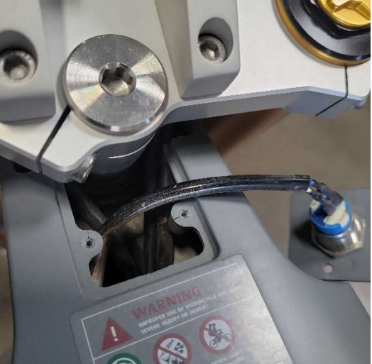
Step 2: Follow the cable coming off the back of the display unit to locate where it connects to the bike's main harness. Unplug.